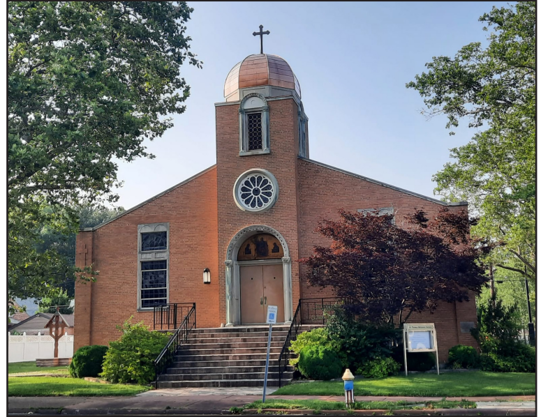
St. Thomas the Apostle Orthodox Church has been located at Nottingham and Donovan since the late 1950s.

As such, on May 5, 1935, on the first Sunday after Pascha (the Orthodox Christian Easter), also called the Sunday of St. Thomas, members of the Romanian Fraternity led