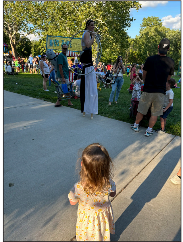
A young eventgoer enjoys watching a stilt walker at Grub and Groove.

Organizers and volunteers spent three days setting up, hosting and cleaning up. Check out the Facebook page for more information and for sign-up sheets to help for next year.