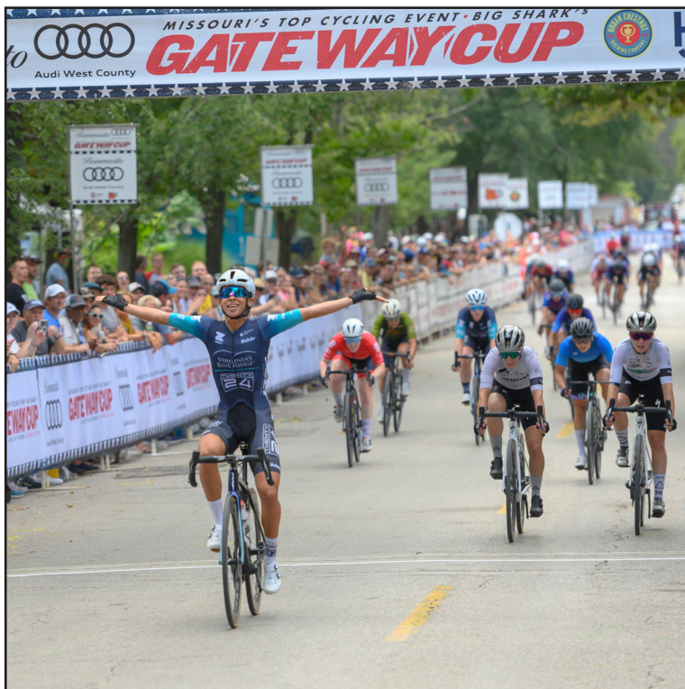
The 38th annual Tour de Francis Park brought over 650 racers to St. Louis Hills.

For more information, visit the website: https://gatewaycup.com/ .