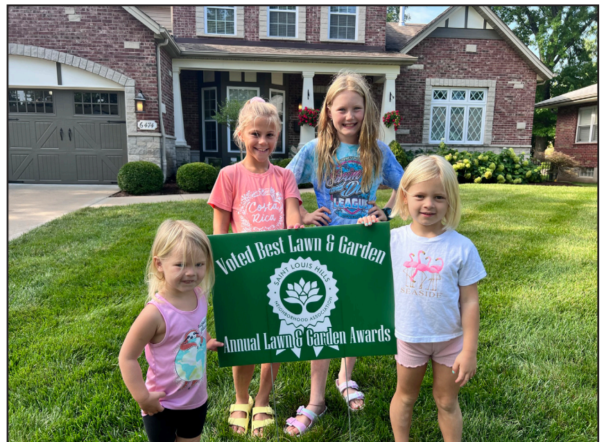
One of this year's Lawn and Garden Award winners.